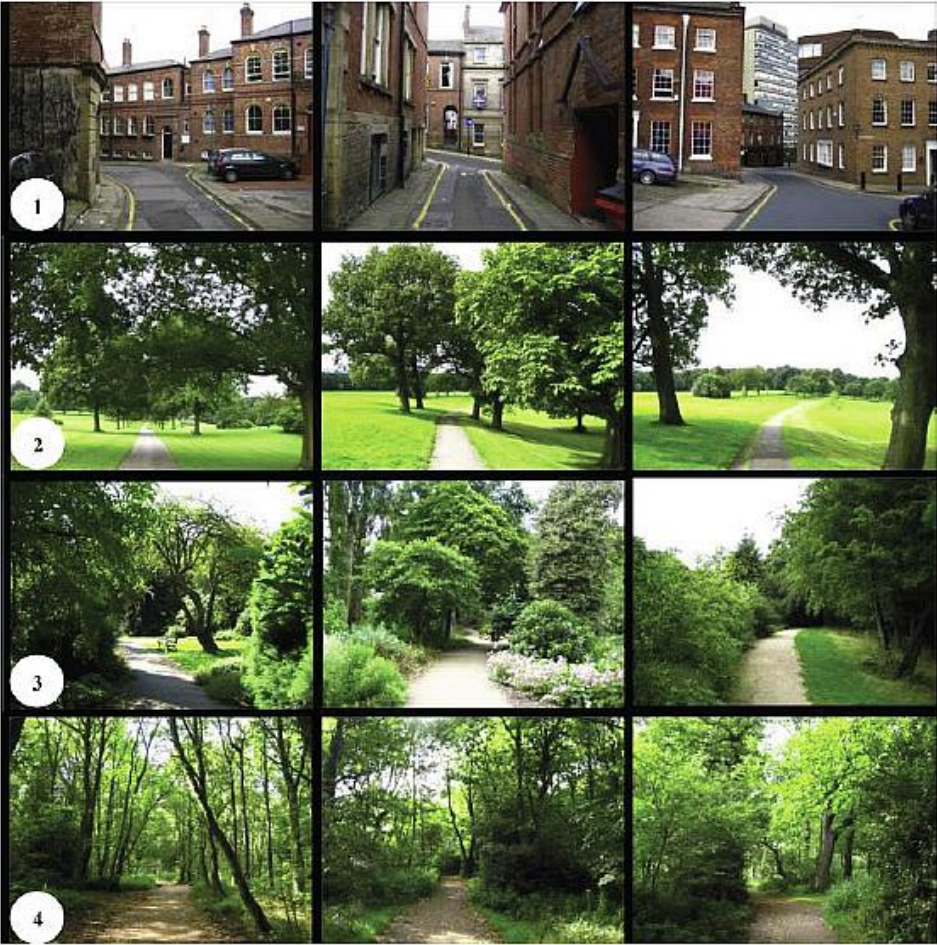
Fig. 1. Sample photos of the four environments: 1. urban street; 2. parkland; 3. tended woodland; 4. wild woods.

and streetscape. The parkland presentation (Figure 1.2) showed a part of the Sheffield Graves Park with generally mature specimen trees, pruned to remove lower branches, set in mown grass. Key features of this setting were that it contained only two vegetation layers (mature trees and mown grass), as well as being well-tended and open, so that distant elements within the park were clearly visible. The tended woodland presentation (Figure 1.3) depicted the Sheffield Botanical Gardens, a park-like woodland setting containing clumps of native and exotic vegetation consisting of trees, shrubs and ground-covering plants, separated by small mown grass glades. Key features of this setting were that the vegetation was denser and more structurally complex than the parkland, containing ground covering vegetation and shrub layers, as well as trees and mown grass, and was well-tended with a well-defined sense of enclosure. The wild woods presentation (Figure 1.4) depicted parts of Sheffield Greno Woods, a mature woodland with a number of vegetation ‘layers’, including a well-developed understorey of shrubs and regenerating trees and rough ground cover. This setting had roughly the same level of enclosure as the tended woodland but with a less-tended, more irregular and ‘wild’ appearance. People could be seen in the middle to far distance of the